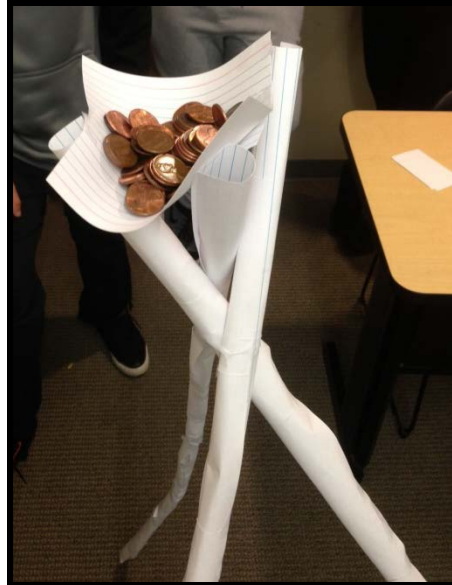
Figure 1. Overall best cost-benefit ratio House of Cards design