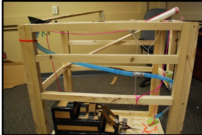
Figure 4. The Baseball Cage Rube Goldberg Machine